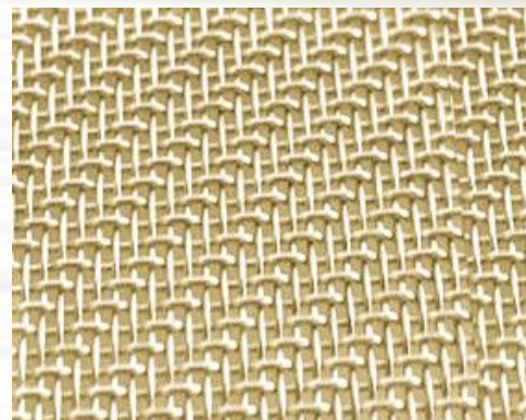
Brass Wire Mesh