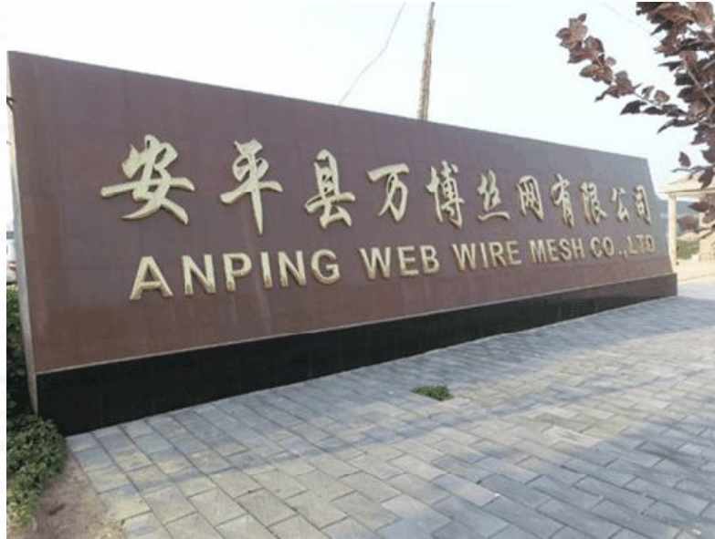
Factory in AP